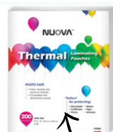
CLICK PICTURE FOR AMAZON LINK