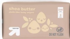
2 PACKS BABY WIPES