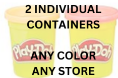
2 INDIVIDUAL CONTAINERS ANY COLOR ANY STORE