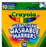
2 boxes Crayola Markers