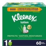
1 CUBE Kleenex Tissues