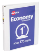
2- 1" Binders